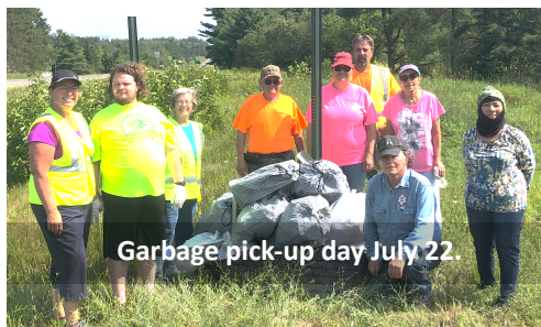
Garbage pick-up day July 22