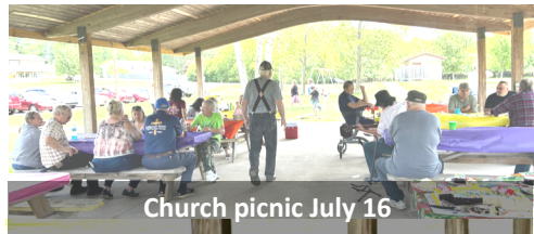
Church picnic July 16